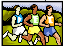
Start of course and bus parking