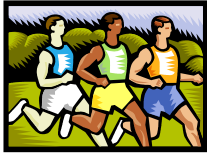
Start of course and bus parking